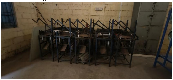
Used to manually cut open the RCN after boiling. Operated by labours.