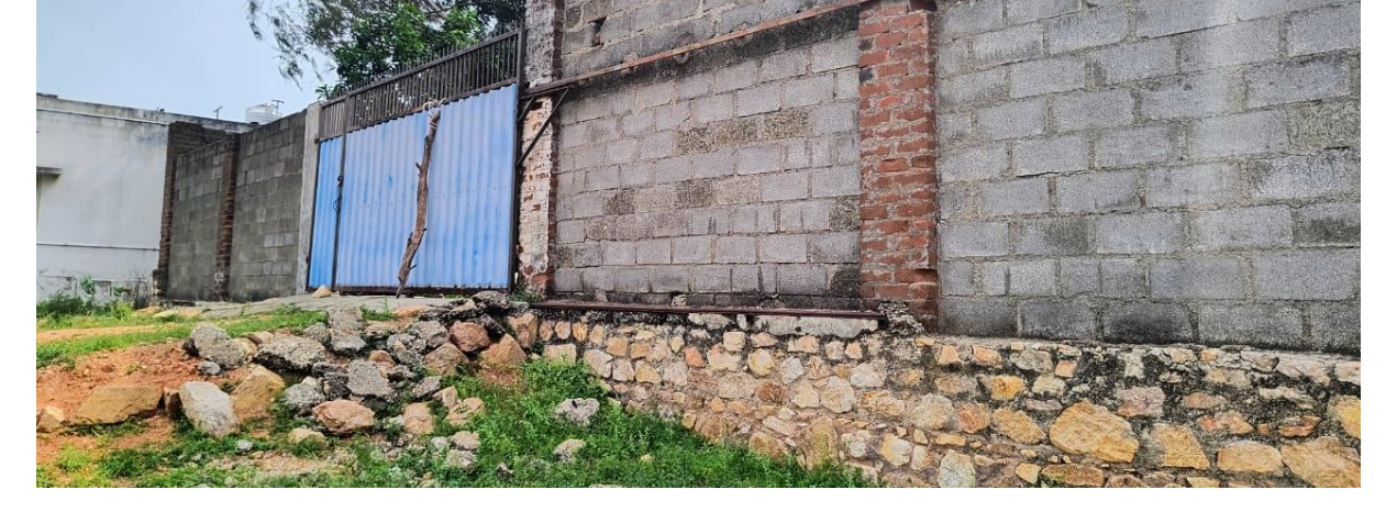
Backside open land: Can be utilised if required later.