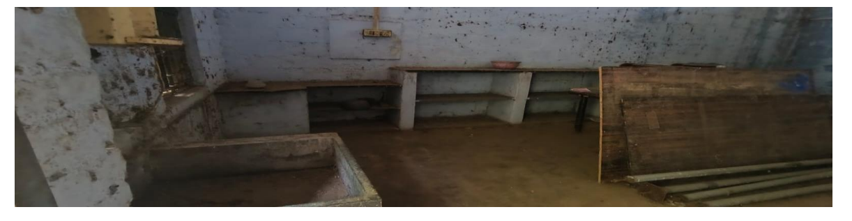
Mess can be used for cooking for staff.